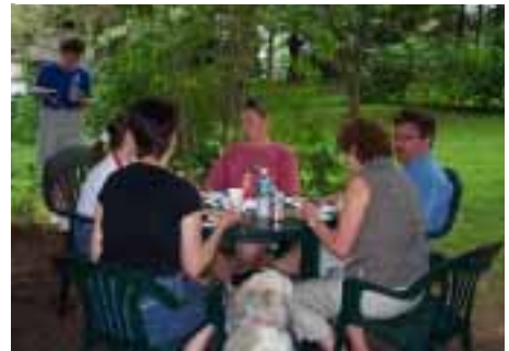
Volunteers enjoying good friends and food.